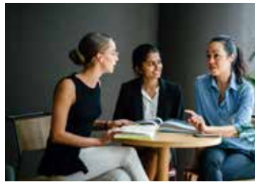
CONCEPT & IDEAS

We all desire a space that feels authentically our own. While working with us, you know ACCURATELY what's going on – we keep you well-versed with the updates on every process of your Product.