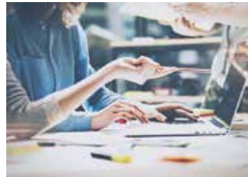
DESIGN & CONFIRMATION